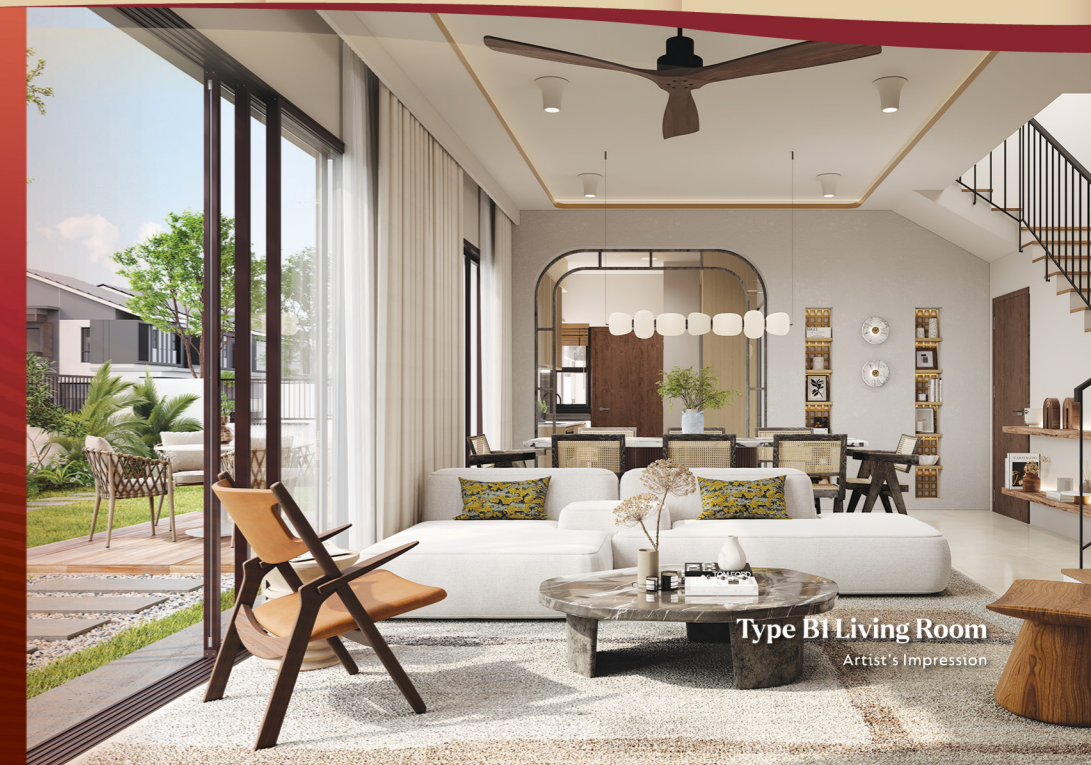
Type B1 Living Room Artist's Impression

The expansive living area flows effortlessly from your cozy home to a thoughtfully crafted green space, creating an enhanced sense of openness and tranquility.