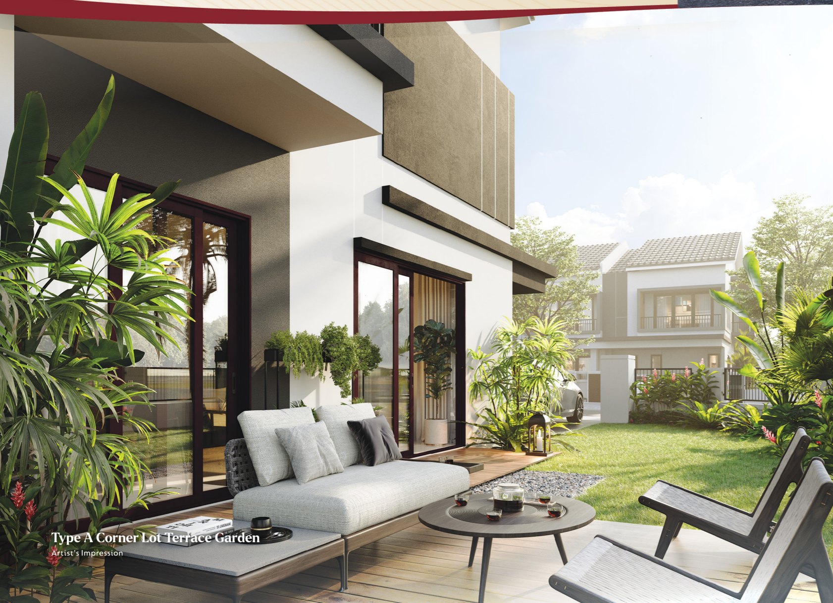
Type A Corner Lot Terrace Garden Artist's Impression