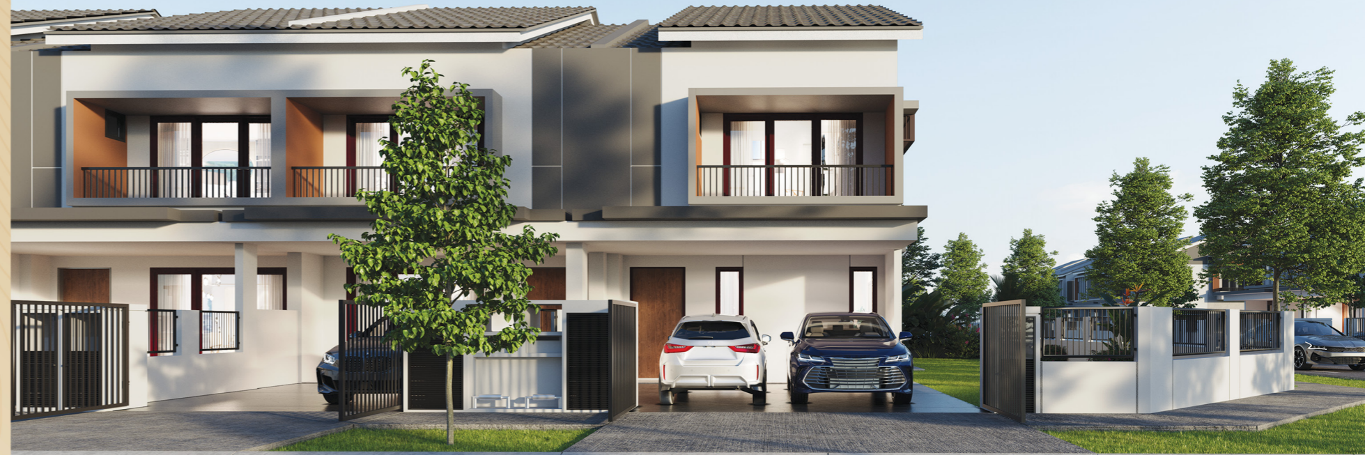
Facade Front View Type B1 (20' x 70') Artist's Impression

Discover an unparalleled lifestyle at Intrika 2, where wide frontages open to lush park landscapes right at your doorstep. A collection of elegant double-storey homes, with options of 20' x 70' or 22' x 95', complete with Nusantara-inspired facades and private terrace gardens ideal for family moments — this is where life is free to flourish in its fullest.