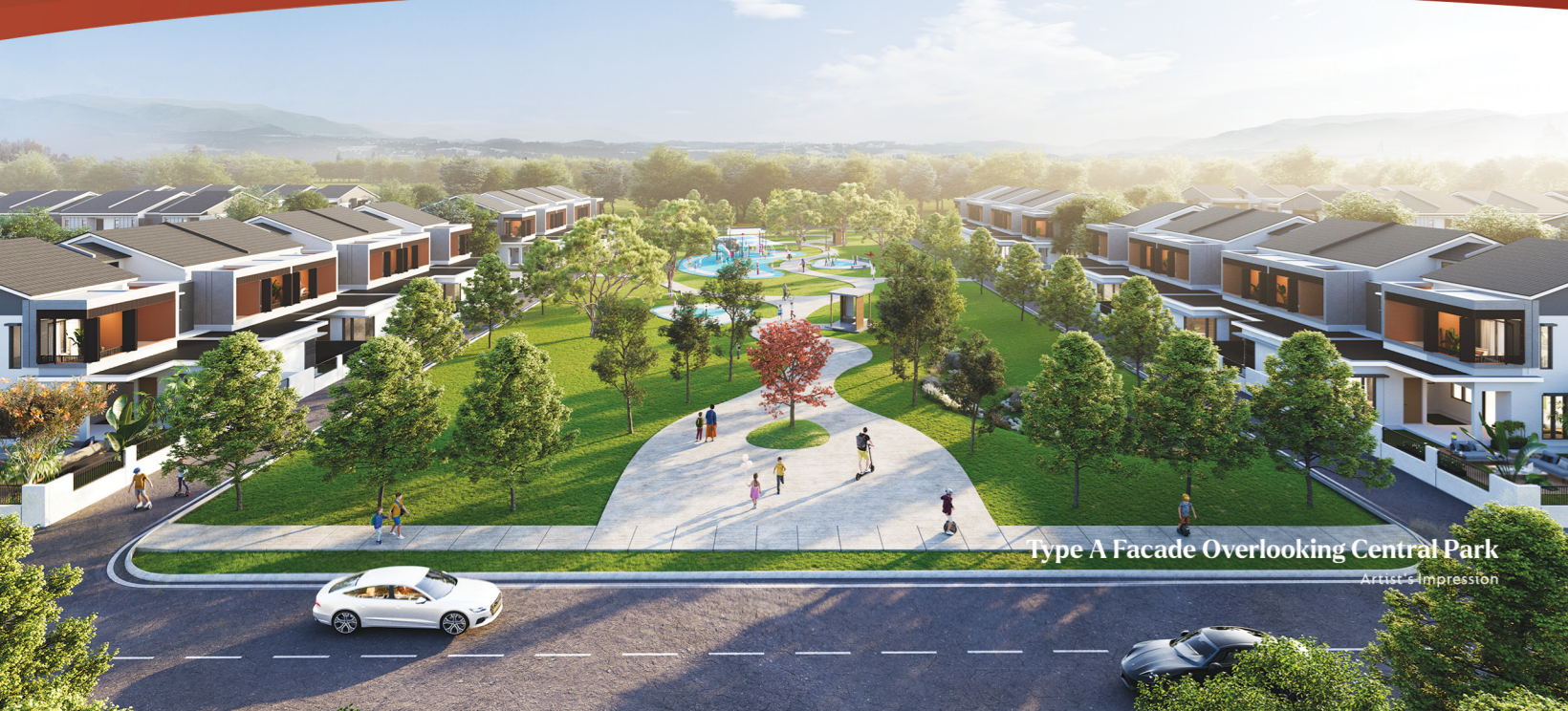
Type A Facade Overlooking Central Park

The land configuration, dimensions and area vary from unit to unit. A copy of the plan showing the actual configuration and measurements of any lot can be made available upon request.